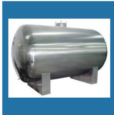
Stainless Steel Tanks