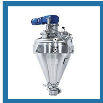
Conical Vacuum Dryer