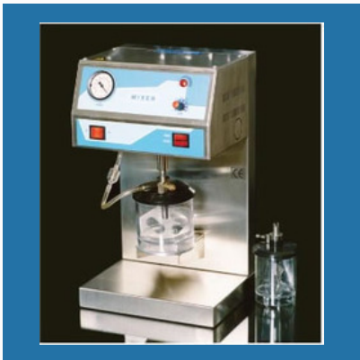
Conical Vacuum Mixer