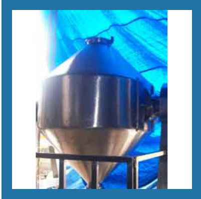
Double Cone Blender