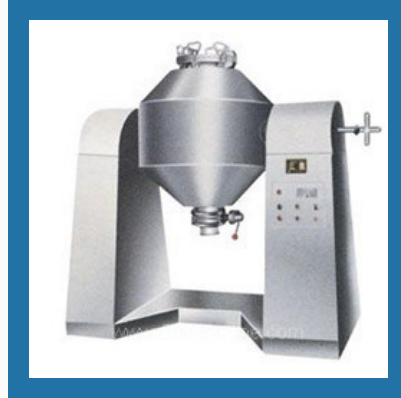
Double Cone Vacuum Dryer