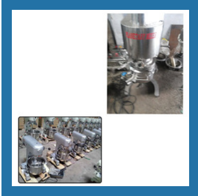
Planetary Mixer for Food Industry