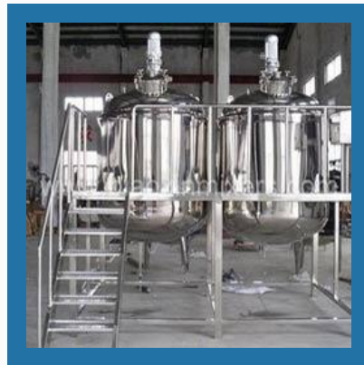
Cosmetic Mixing Vessel