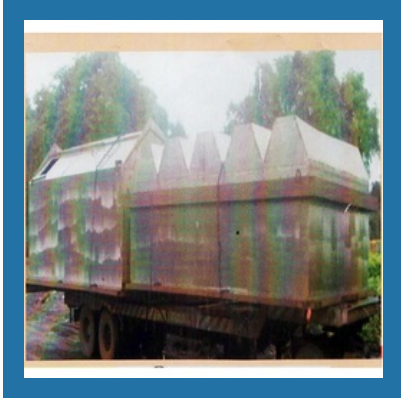
Extractor Wedge Filter