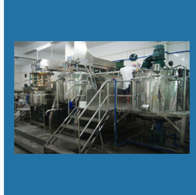
M Seal Mixer