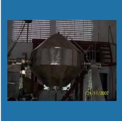
Double Cone Dryer