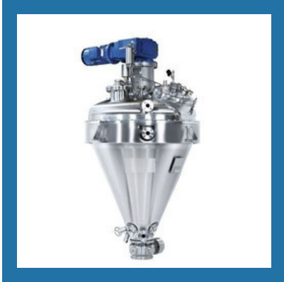
Conical Vacuum Dryer