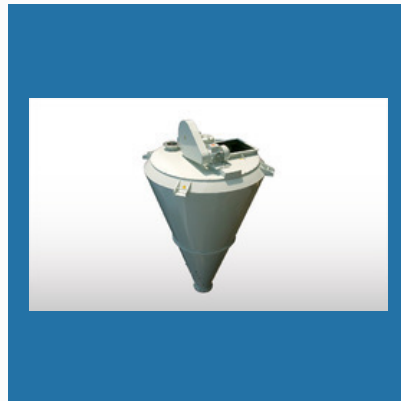
Conical Screw Mixer