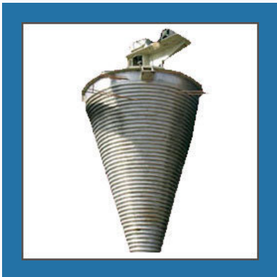
Nauta Type Conical Mixer