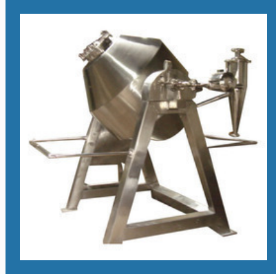
Roto Cone Dryer