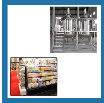
Cosmetic Industry Mixing Vessel